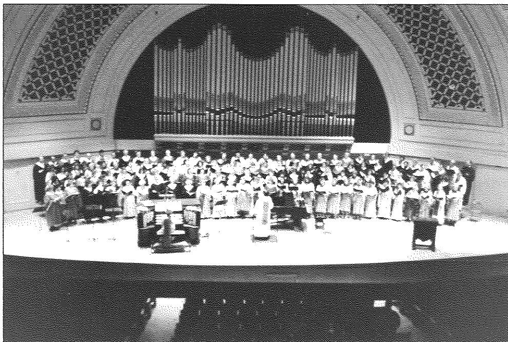
Autumn Festival of Choirs at Hill Auditorium